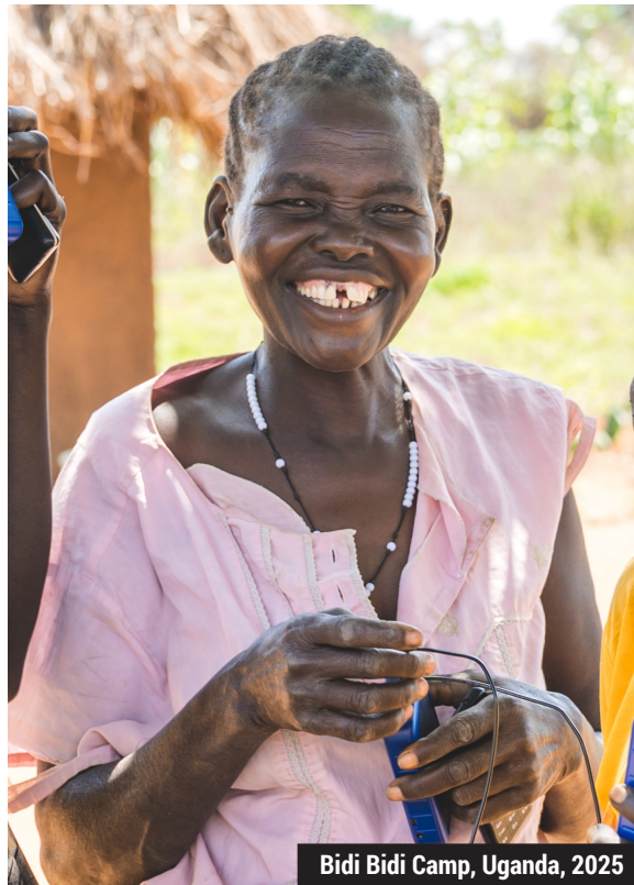
Bidi Bidi Camp, Uganda, 2025