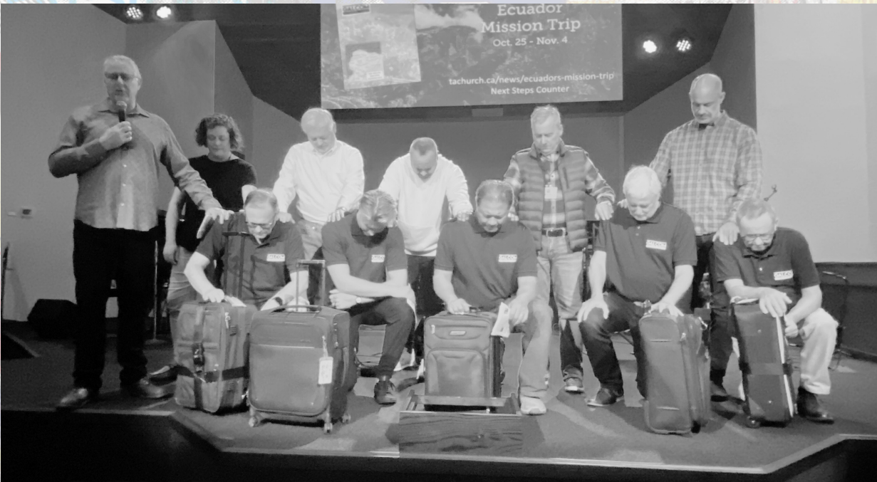
The TAC mission team, with suitcases of radios, being commissioned before their trip.