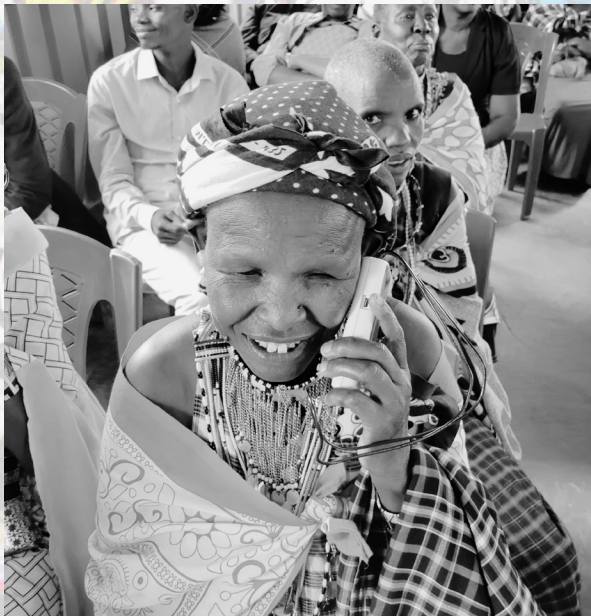
A Maasai woman listening to her Maasai Bible.

You have been an integral part of Galcom’s global outreach with your prayers and support. This report focuses on some interesting ways Galcom has partnered with people just like you. How can we help?