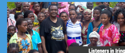
Listeners in Iringa

Challenges: There is a severe shortage of essential equipment, including headphones and microphones. Overcomers FM also relies on a borrowed transmitter and rents space on a mast because they do not have their own.