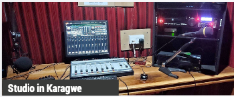
Studio in Karagwe