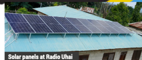
Solar panels at Radio Uhai

Challenges: Galcom recently installed solar panels for Radio Uhai, solving the problem of unreliable power and enabling them to broadcast 24/7. This has also resulted in significant savings to the station.