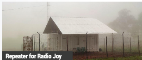
Repeater for Radio Joy

Challenges: Radio Joy needed to overcome geographical challenges to increase its signal range. With the assistance of Galcom, a repeater station has been placed in the Heru Juu Mountains, reaching under-served locations.