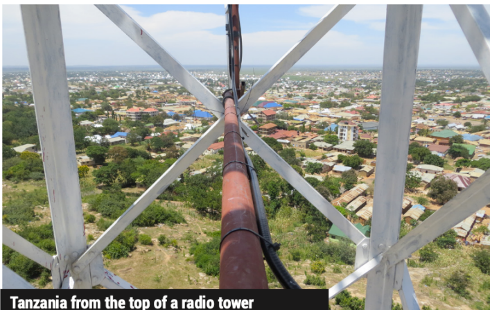
Tanzania from the top of a radio tower

To learn more about this project, scan the QR code above to watch Francis' documentary on YouTube.