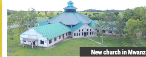
New church in Mwanza

Challenges: Equipment upgrades are needed, including the studio mixer, broadcast console, and computers.