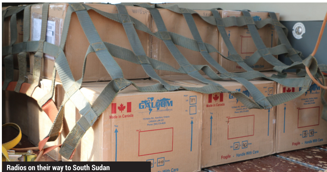
Radios on their way to South Sudan

Please visit galcom.org for information on any upcoming events.