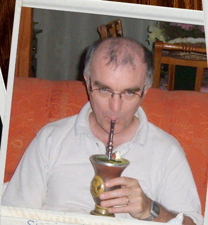
Sipping the local tea in Naranjal, Paraguay, 2007