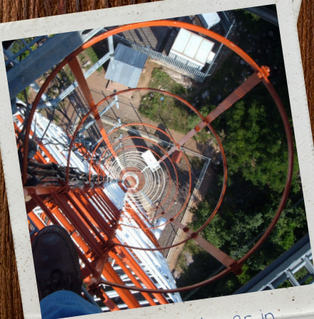
Top of the tower in Mwanza, Tanzania, 2008