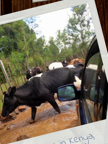
Traffic jam in Kenya, 2013