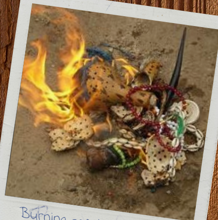
Burning magic charms in Mwanza, Tanzania, 2008