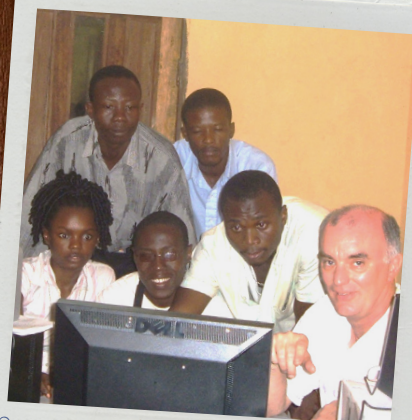
Amazement at the new station equipment in Sierra Leone, 2009