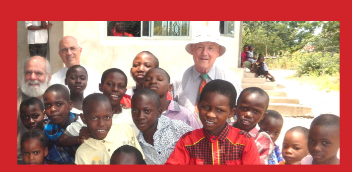
lain and the team with some of the grateful children at the radio station in Tanzania, 2015.