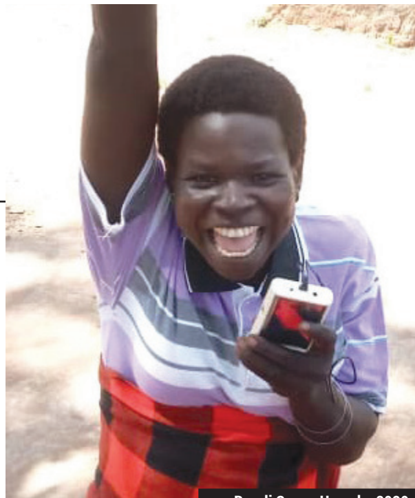
Boroli Camp, Uganda, 2020