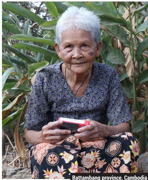
Battambang province, Cambodia